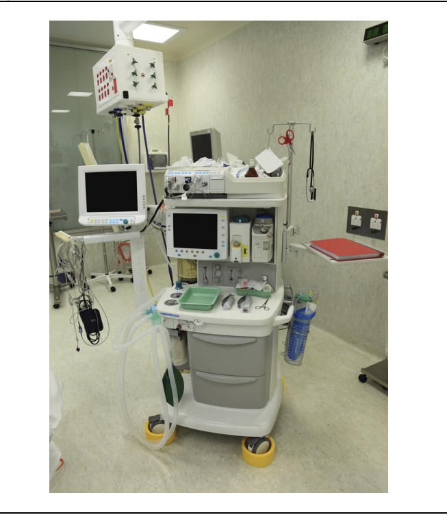
Figure 1. Anesthesia Machine

Honeywell manufactures many products that may be used in anesthesia machines. They are designed to help control pressure, airflow and temperature, as well as to provide output for smooth motor control. (See Figure 2.)